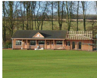
Progress is being made; the roof went on last week.

The new extension will provide additional player changing rooms, showers, umpire changing rooms, equipment store, patio area, improved kitchens facilities, female changing and a new score box to complement the digital score board. What fantastic facilities this will provide for our players, officials and spectators. Not only a facility for current members, but one for cricketing generations to come.