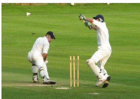
Stumping vs. Selby