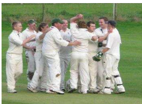
1 st XI victory vs. Selby